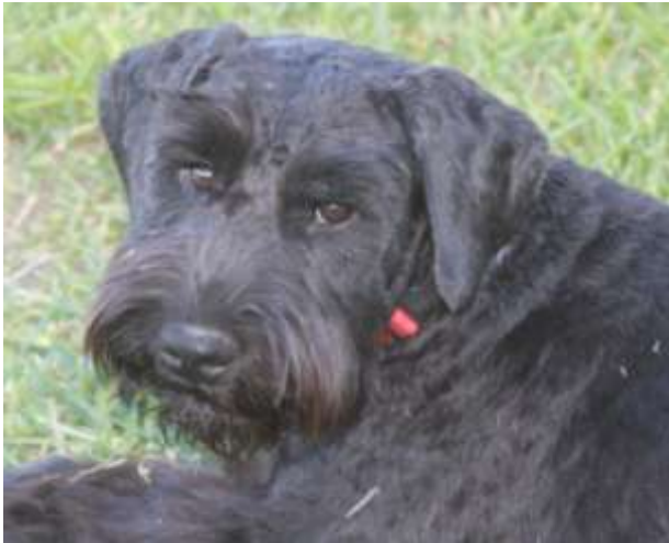
Sammy going to Connecticut.

HT-Z had three 6 month old puppies this summer. Despite their scraggly look, their long tails, their natural ears, their matted hair, three people identified them as Giants. We rescued them on a Sunday and promptly named them The Rat Pack. Dino was named for Dean Martin; he was the lover (think “Everybody Loves Somebody Sometimes”) and lived up to that name, spending his entire trip to San Marcos kissing my arm. Frankie was named for Frank Sinatra; he arrived at my house and promptly left the others to go exploring (think Frank Sinatra’s “My Way”). And then there was Sammy. Named for Sammy Davis Junior, little Sammy was the funny man, the candy man. He loved toys and surrounded himself with everything fun. After vetting and grooming, we had a good looking group of young boys. Of course, Turti had to teach them the ropes – or should I say the inner puppy came out and I had 4 puppies running around the house!