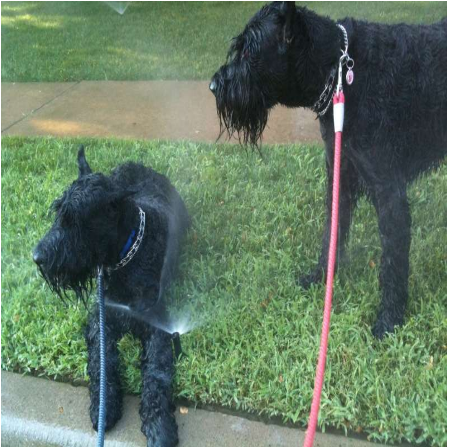
Reba & Izzy out for a walk.