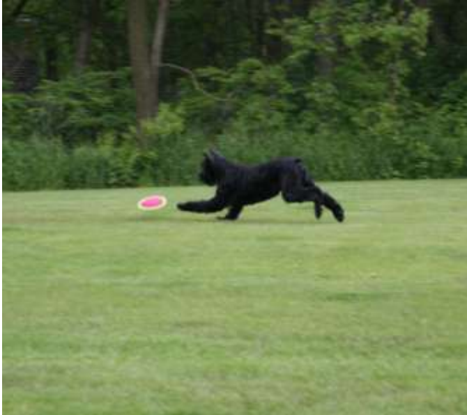
Gaining on it!!!