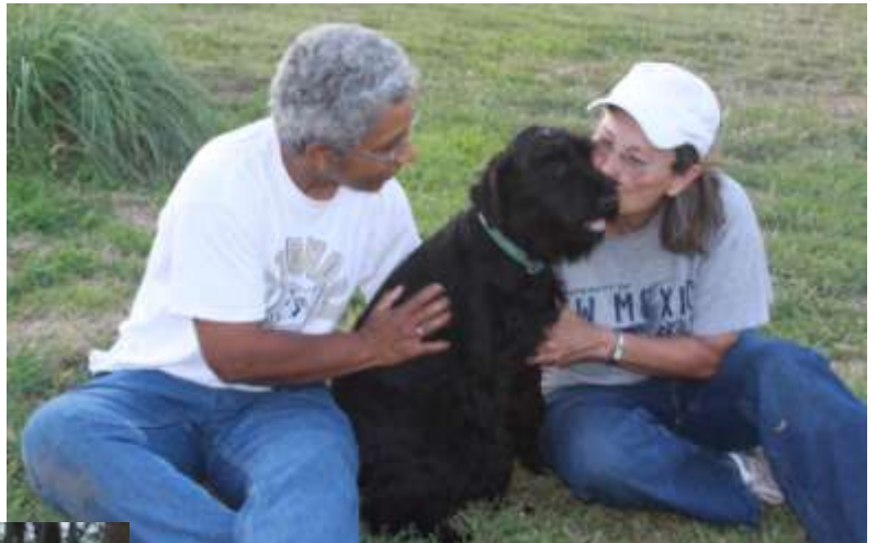
Dino with his new forever family.