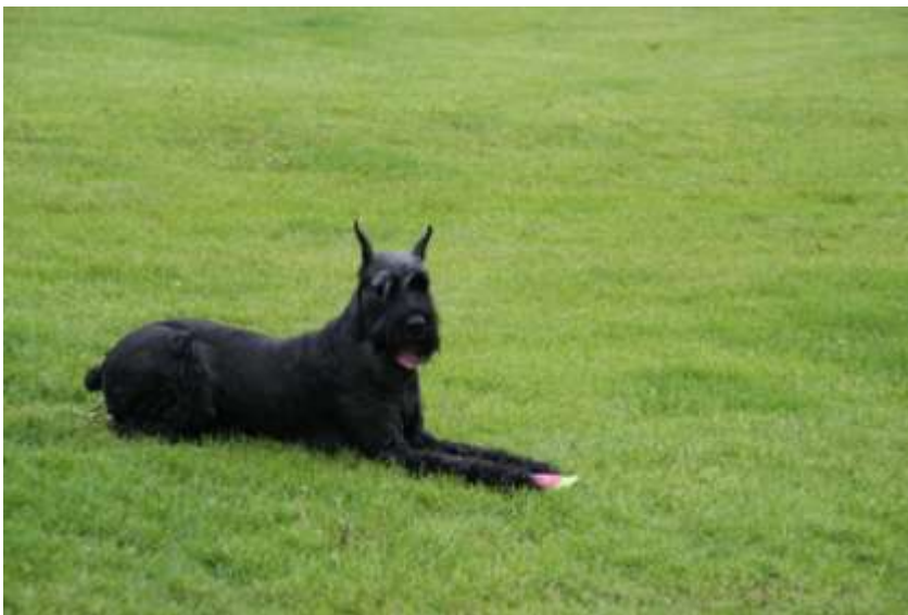
Now I'm Pooped.....