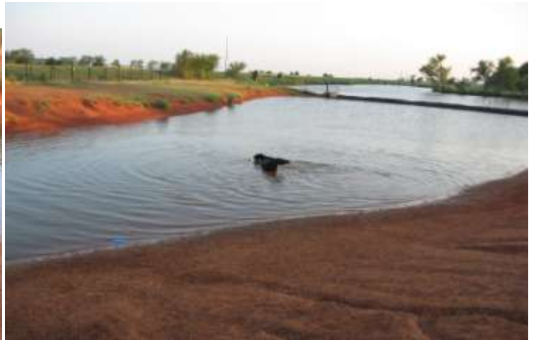
Maggie and Sebastian enjoying the lake at the Dog Park.