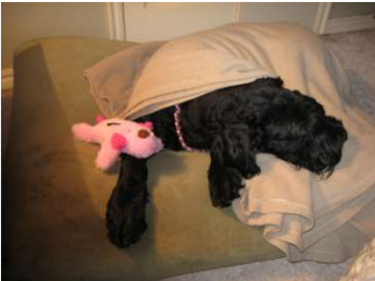
Maggie snuggled up.

http://www.dummies.com/how-to/content/handling-the-problems-of-old-age-in-your-dog.html