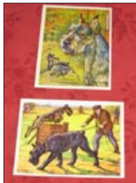
5. Original Trading Cards -Austria Tobacco Co. 1952