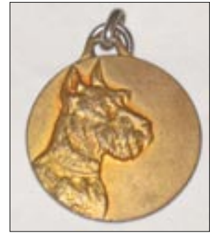
24. Vintage watch fob - circa 1940s