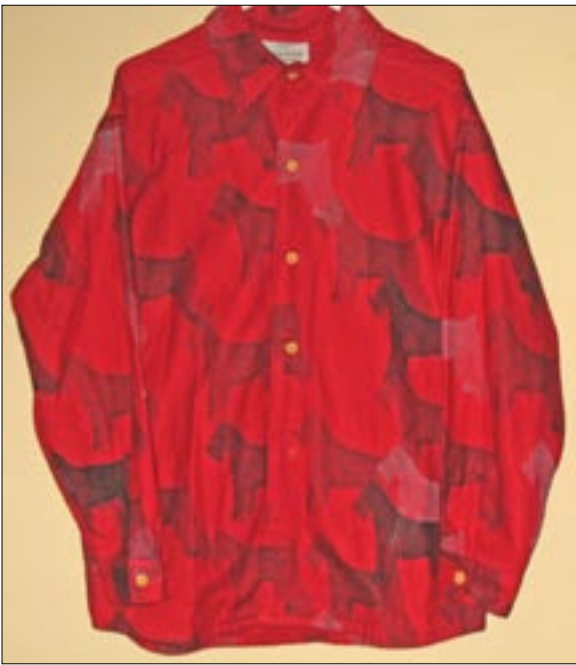
12. Handmade flannel ladies shirt/jacket covered with Giants - Size L