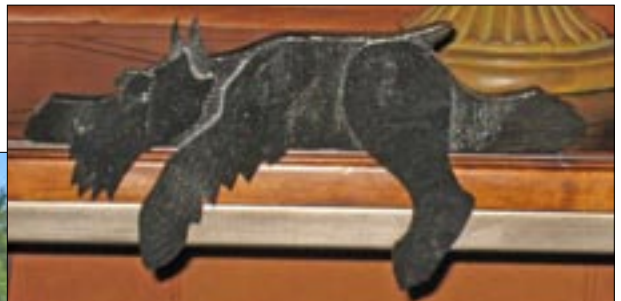
30. Painted wooden "Lazy Giant."