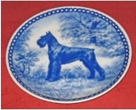
1. Danish Blue Porcelain Collector Plate.