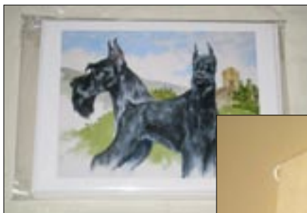
18. GS Note cards (1)