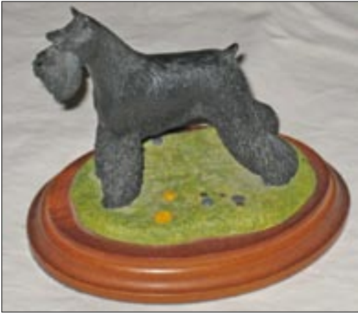
22. GS figurine