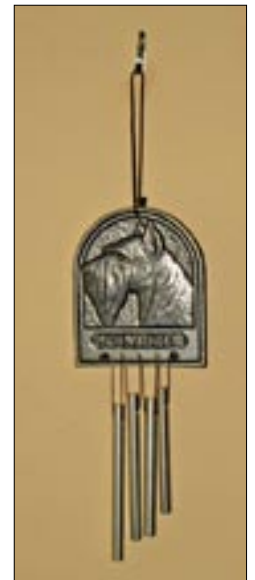
14. Small GS wind chimes