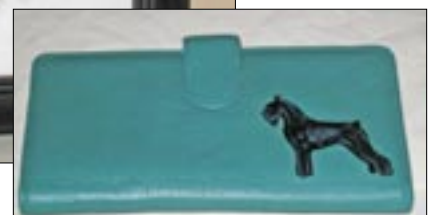
21. Teal Leather Wallet