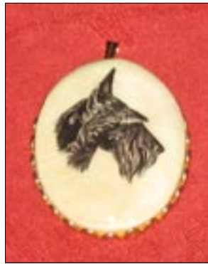
16. GS Head study pendant