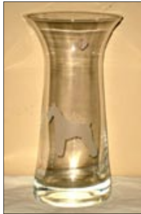
26. GS etched crystal vase