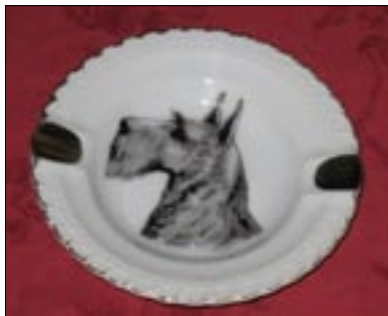
28. Small vintage GS decorative ash tray (3" diameter)