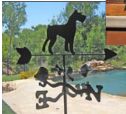
29. GS Decorative Weather vane, painted steel