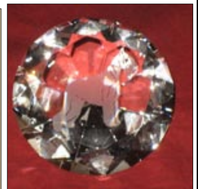
11. Large GS-etched Austrian Crystal Diamond