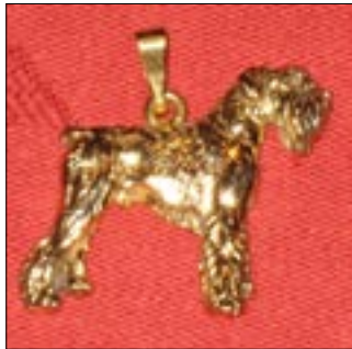
4. Gold-plated charm