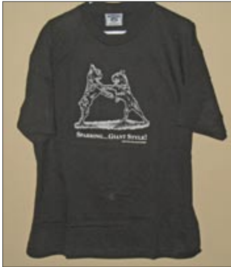
25. Famous Sparring Giants (by Gary McGirr) Black T-shirt size XL