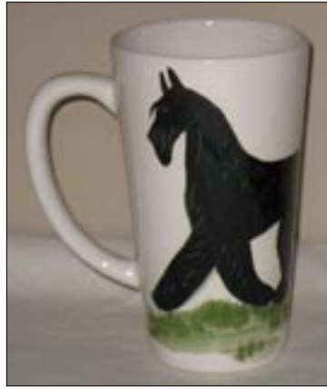
23. Large hand-painted ceramic mug