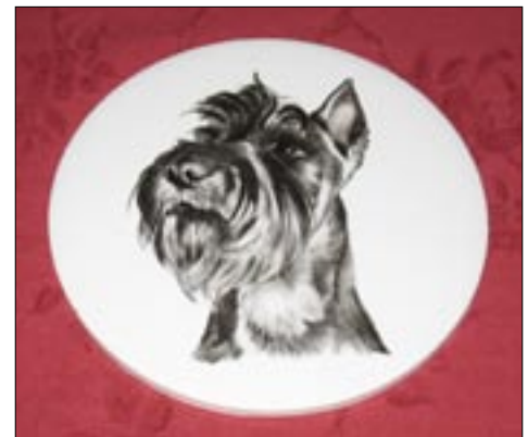
17. Vintage English teapot stand