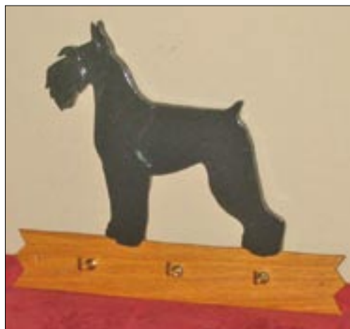
10. GS Painted wood leash holder