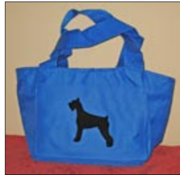
6. Small foil-lined canvas cooler bag with zipper