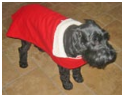
32. Fleece-lined Winter Coats; 2 coats - one red and one black