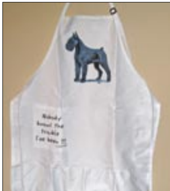
31. Cooking/Grooming Apron.