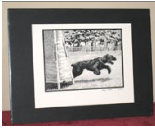
2. Searching the Blind • Limited Edition Print