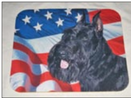
15. GS Mouse pad