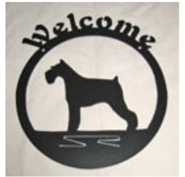
3. GS Welcome sign