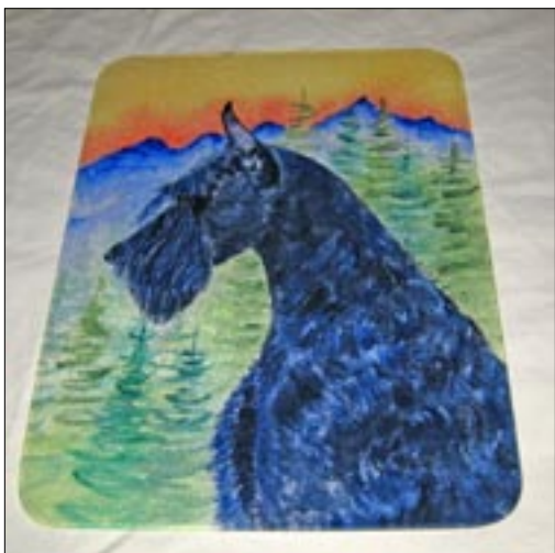
9. Tempered glass GS cutting board