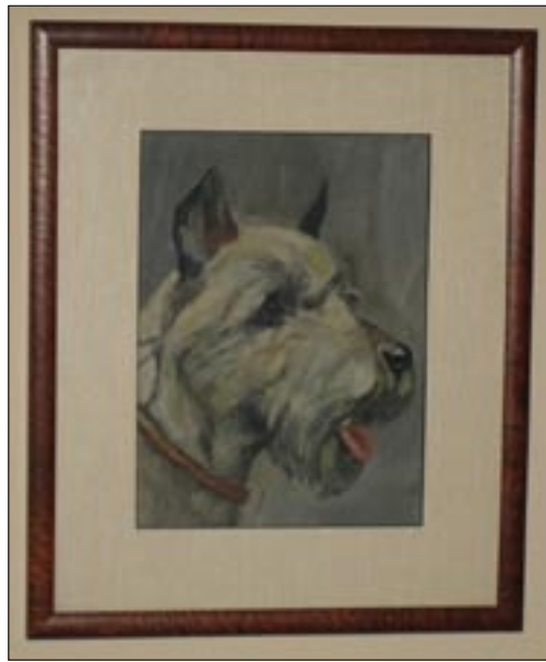
13. Vintage Pepper/Salt oil painting