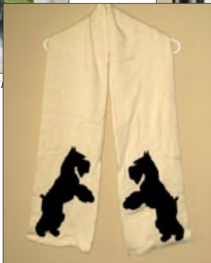
19. Custom knit 100% cotton scarf