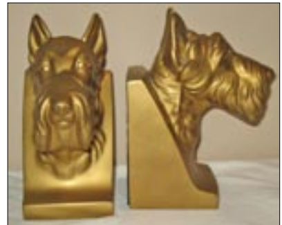
33. GS Vintage antique Brass GS bookend