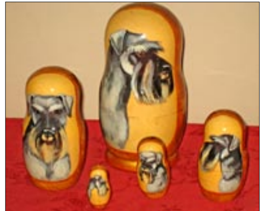
27. Hand-painted GS nesting dolls from Russia, signed by artist