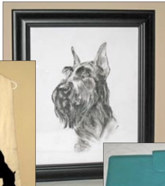
20. Original charcoal drawing from Germany