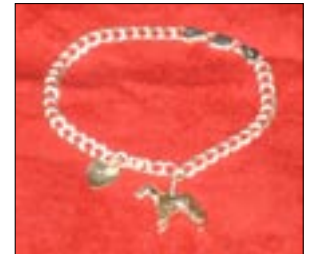
7. Sterling silver charm bracelet with GS charm