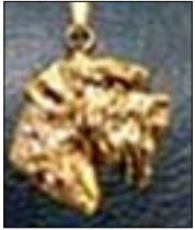
5. Gold-plated charm (from Germany)