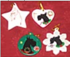
21. Four porcelain hand-painted Xmas ornaments