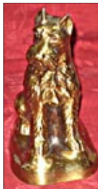
15. GS vintage metal bank