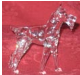
33. GS hard coat glass sculpture