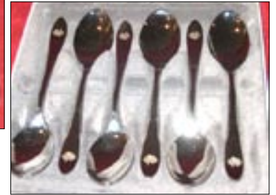
24. Six stainless steel teaspoons with etched GS on handle