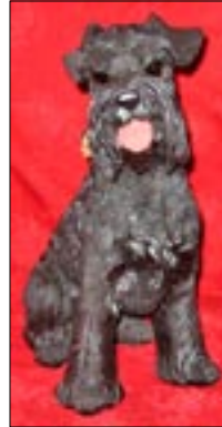
8. 13-inch Schnauzer garden sculpture