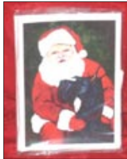
22. GS Christmas cards (box of 10)