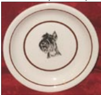
25. English china decorative plate