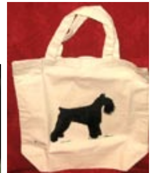
17. Canvas tote with faux fur GS