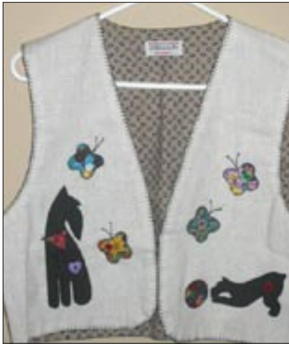
18. Ladies vest (Size M)