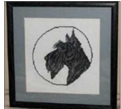
31. Framed cross-stitch head study