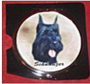
19. Mirror compact