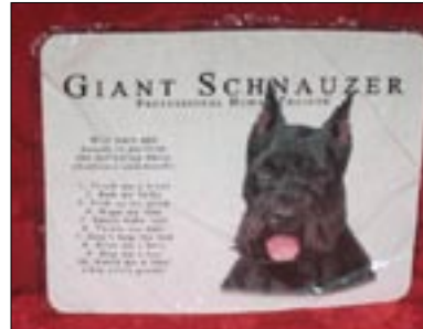
13. GS Mouse pad