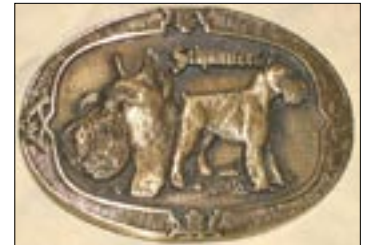
28. Antique brass belt buckle