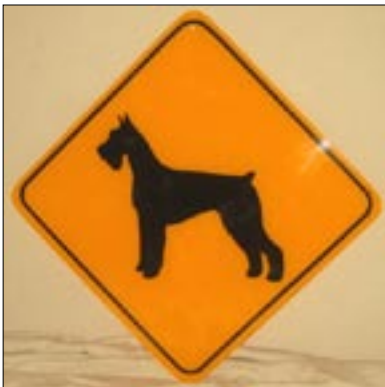
14. GS sign