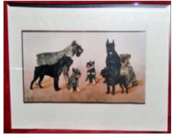
20. Mini-Standard-Giant poster