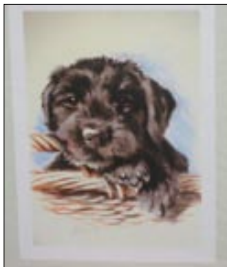
30. GS puppy in basket – signed pastel from Germany