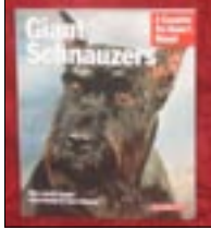
6. Giant Schnauzer Book