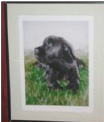
29. GS puppy profile – signed pastel from Germany