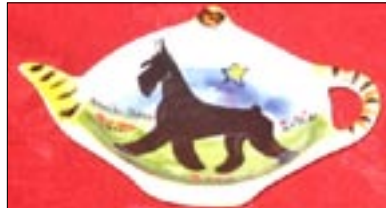
12. Hand-painted decorative tea bag holder