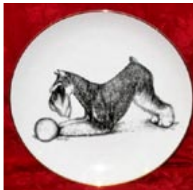
27. Pepper/salt GS decorative plate