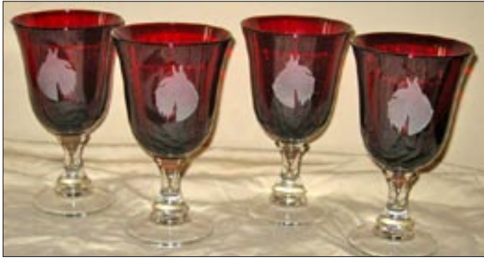
2. Four 12-oz. Heavy crystal glasses.