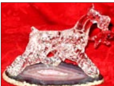
32. GS crystal sculpture – Giant carrying his favorite teddy