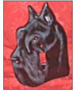
4. GS light switch plate.