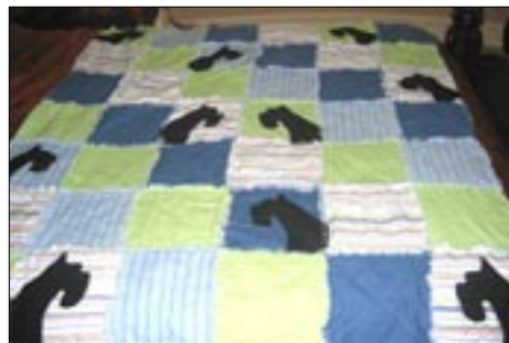
16. Handmade GS rag quilt - full-size