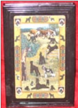
11. Desk note caddy