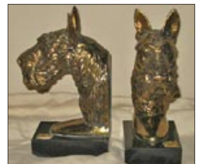
34. Vintage antique brass bookends, sitting on onyx base