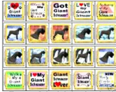
3. Twenty-pc. Italian link photo charm bracelet.