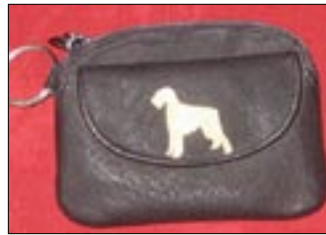
23. Leather coin purse/key ring