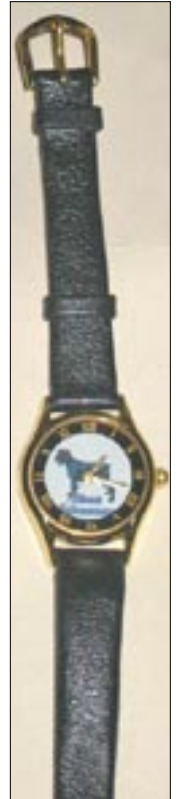
9. Ladies GS wrist-watch w/ leather band